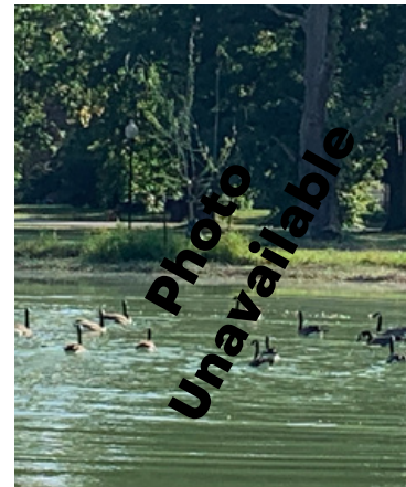
Spencer Longacre Forester I