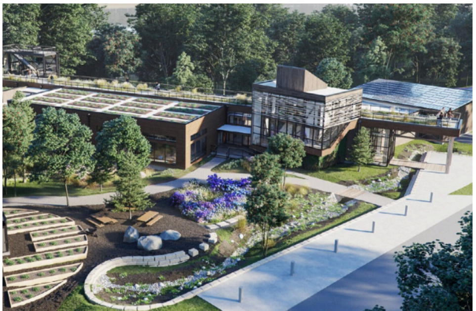
Rendering of future Shawnee Outdoor Learning Center

If you have followed growth of the Louisville is Engaging Children Outdoor Initiative since its launch in 2008, you have seen the steady effort to create opportunities for youth and families to explore nature right in west Louisville that complement opportunities available at Jefferson Memorial Forest. Construction of a bicycle pump track (2018) and a boat/canoe ramp (2020) in Shawnee Park along with recent completion of construction documents for projects like restoration of Chickasaw Park pond (2021) are advancing this work. The vision of the West Louisville Outdoor Recreation Initiative is to create a neighborhood base in west Louisville for expanding Louisville ECHO programming to serve youth across multiple ages and to build staff capacity that is representative of the community served. This summer we took two important steps in that direction. We installed a temporary program office in Shawnee Park housing 3-5 new staff, which will permit expansion of Louisville ECHO programming. In other exciting news, Mayor Fischer and Louisville Metro Council allocated $2.5 million in the current Metro Budget towards construction of the Shawnee Outdoor Learning Center.